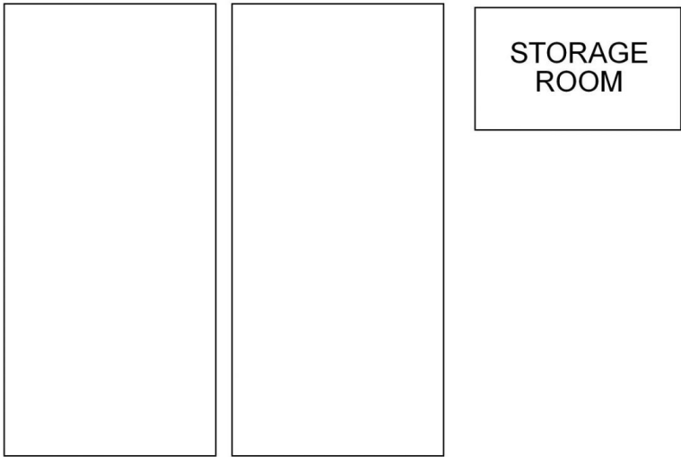
BASEMENT DOUBLE CAR SPACES