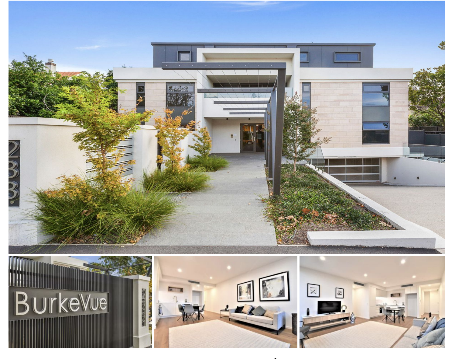
6/233 Burke Road Glen Iris VIC

***UNDER APPLICATION*** Exquisitely finished ground floor apartment in this gorgeous recently completed boutique development -BurkeVue.